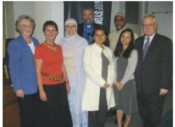
Columban Mission Institute Centre for Peace, Ecology & Justice

In the face of violence or the threat of it, parishes may provide a place for peace and reconciliation to begin. Without dialogue, community silence allows feelings of retaliation that can beget more violence. As well as creating a safe space where people are heard, can the local church provide a place where community leaders encourage and facilitate community efforts for peace?