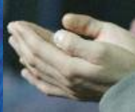
World Youth Day, 2008